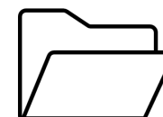
ELA BINDER WITH 5 TABS